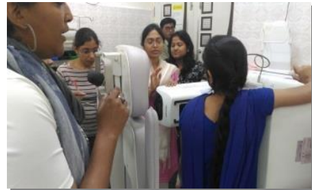
Dept. of Radiodiagnosis AIIMS Patna